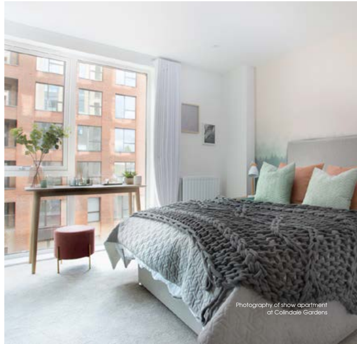
Photography of show apartment at Colindale Gardens